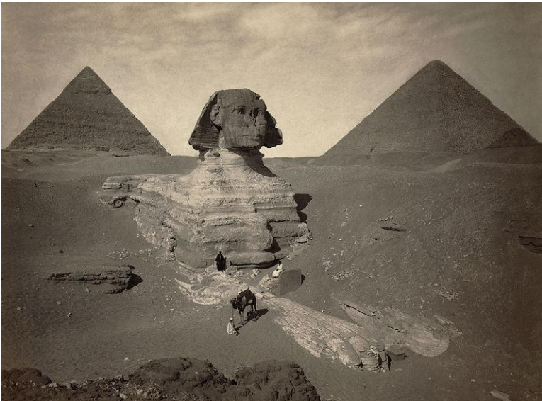
This is a picture of them digging out the Sphinx

The last person named Emile Baraize completed the excavation from 1925 - 1936.